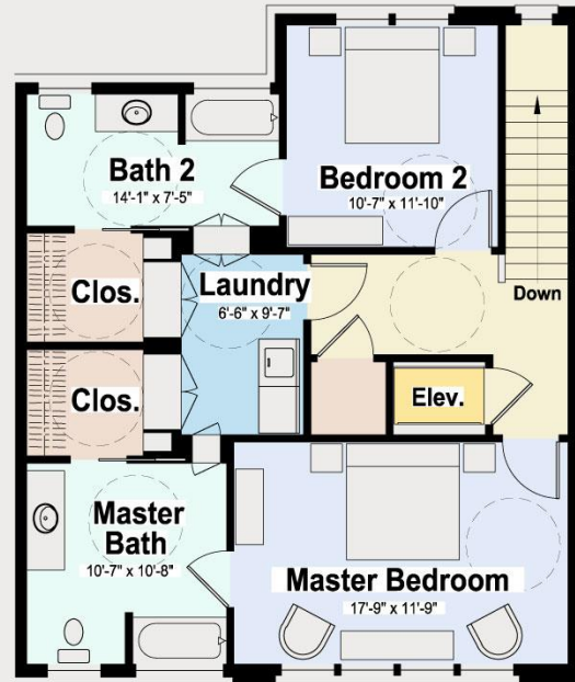
2nd Floor Avalon